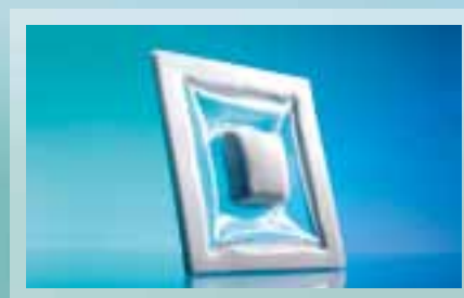
TOPOGRAPHICALLY SHAPED DRESSINGS