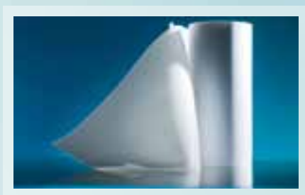
PRODUCABLE AS ROLL-STOCK MATERIAL, ALSO IN VERY THIN LAYERS