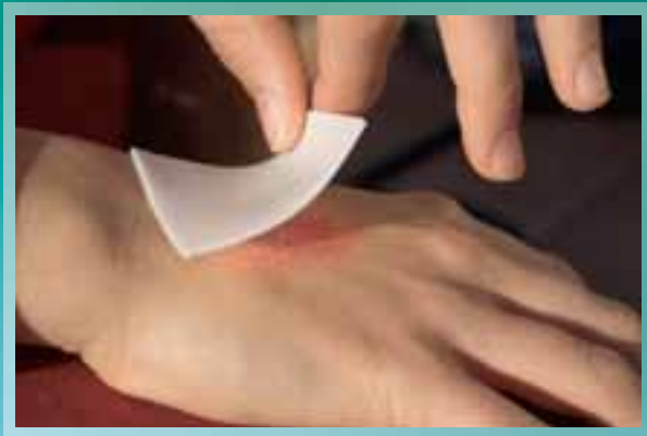
Microporous hydrophilic wound contact layer enables fast acquisition of exudate